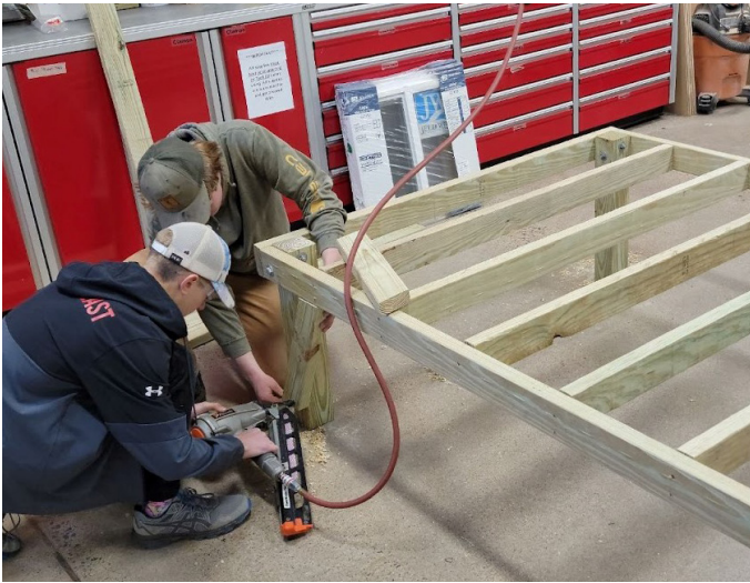
East High Advanced Manufacturing students work on a chicken coop for the East High Agricultural Department using skills learned in Building Trades 1 and Building Trades 2.